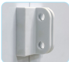
Accepts padlock for added security

WORKSafe® PP Cabinet For Acid And Corrosive, 8 Gal Custom-Made A Separate Poly Tray with Secondary Sump Add Castors and Anti Corrosive Safety Lock